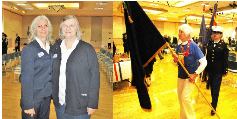
Blue Star Moms & Rosie the Riveter, Sun City AZ. Chapter