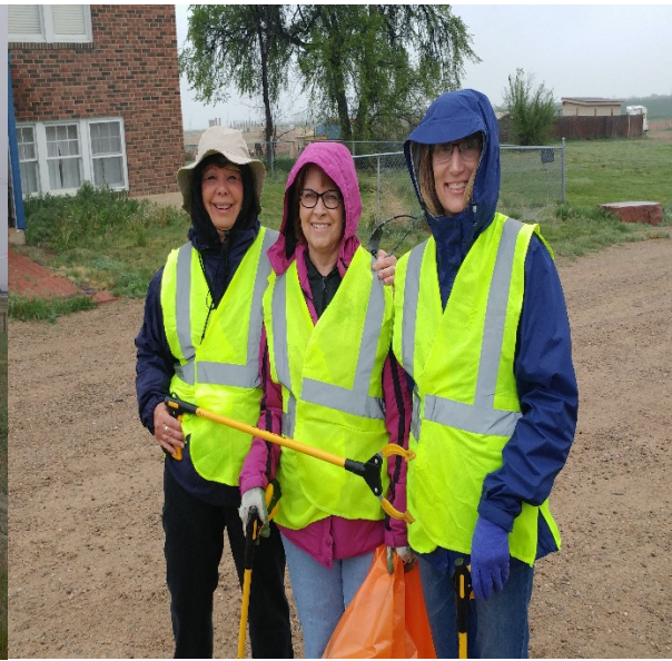
X-4 Honey Bees