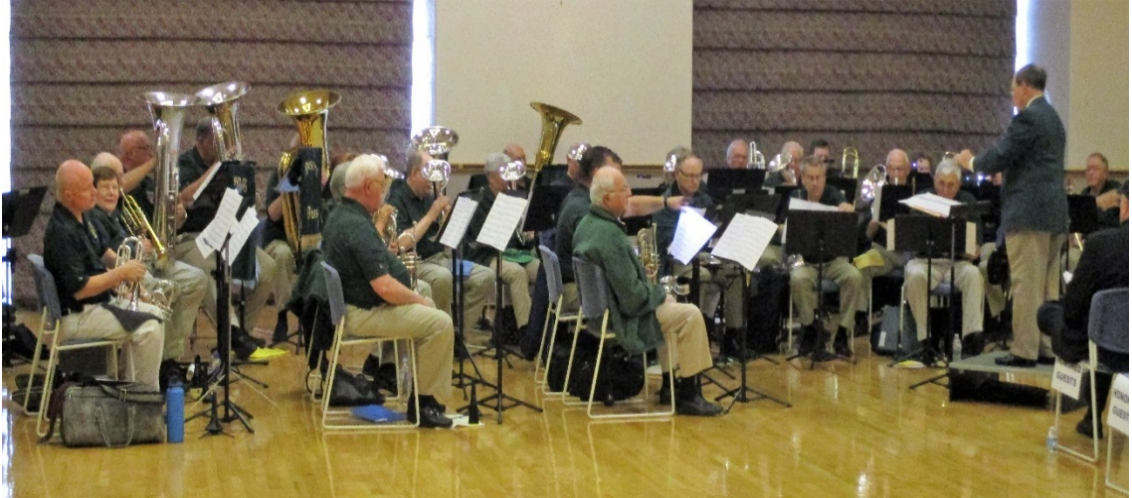
DESERT BRASS BAND