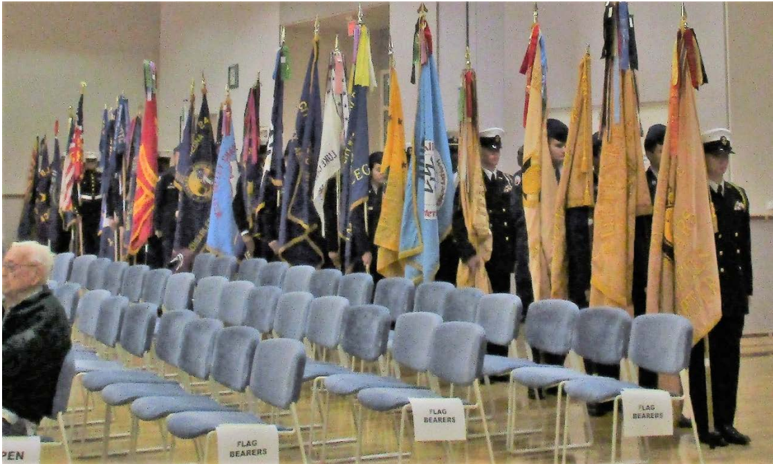
Palm Ridge Rec. Center, Sun City West, Arizona February 28, 2018

"It is Nobler to Serve Than to be Served" (MOWW moto)